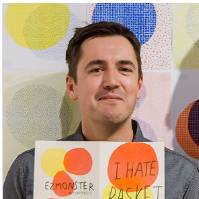
Nuit Blanche Saskatoon

The sixth annual festival will be held on Saturday, Sept. 28, from 7 pm to 1 am throughout Saskatoon's Broadway, downtown and River Landing areas. It will feature 21 artistic installations incorporating light, sound, images, human movement and more.