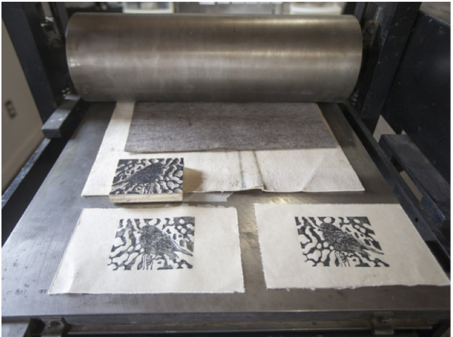
Creative Commons YXE in the Void gallery.

Apr 22, 2016 • Last Updated 5 months ago • 1 minute read